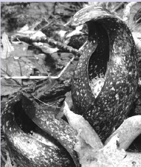
Skunk cabbage ( Symplocarpus foetidus )

NEW ENGLAND WILD FLOWER SOCIETY 180 Hemenway Road, Framingham, MA 01701 T 508-877-7630 F 508-877-3658 TTY 508-877-6553 education@newenglandwild.org www.newenglandwild.org