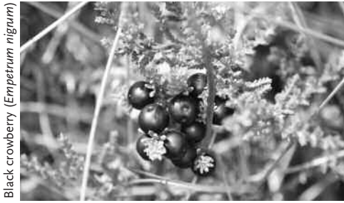
Black crowberry ( Empetrum nigrum )