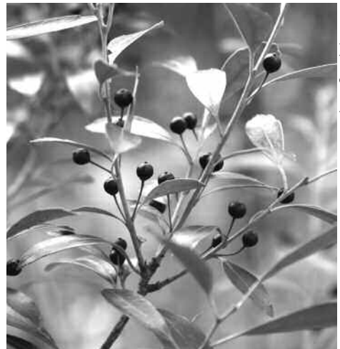
Inkberry ( Ilex glabra )

Certificate: Core: Adv.FB/Adv.HD; Elective: all certificates