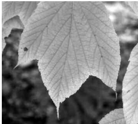
Striped maple ( Acer pensylvanicum )