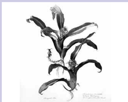
Nidulorum burchellii by Margaret Mee