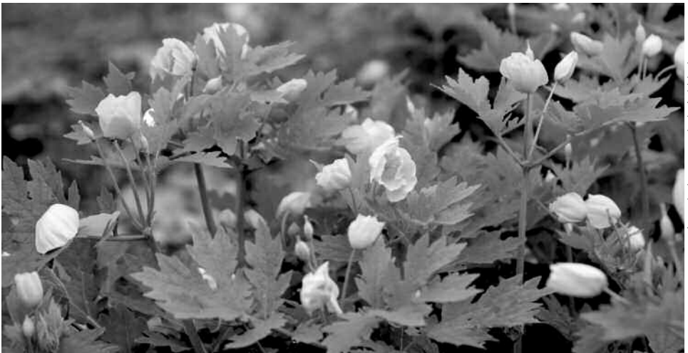
Celandine poppy ( Stylophorum diphyllum )

Cosponsor: Massachusetts Association of Conservation Commissions