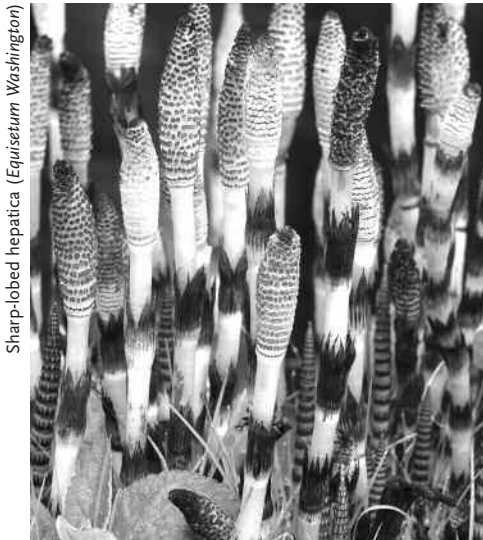
Sharp-lobed hepatica ( Equisetum Washingtoni )

Cosponsor: Massachusetts Association of Conservation Commissions