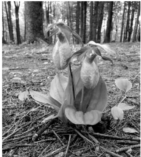
Pink lady's-slippers ( Cypripedium acaule )