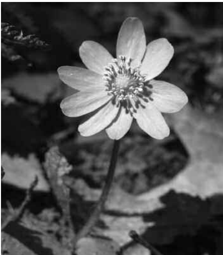
Sharp-lobed hepatica ( Hepatica acutiloba )