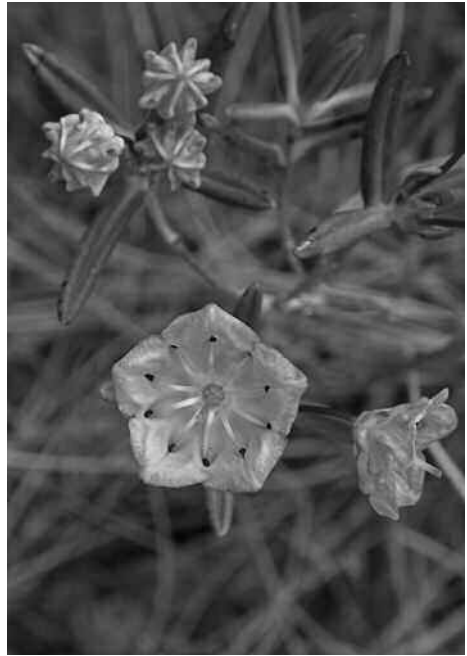
Bog American-laurel ( Kalmia polifolia )