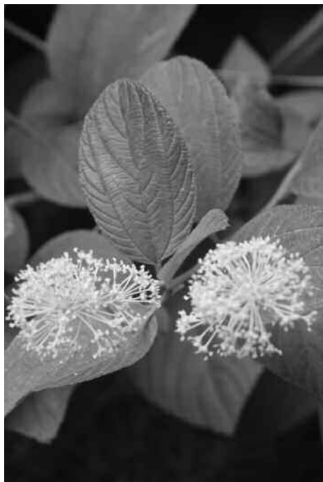
New Jersey tea ( Ceanothus americanus )

Cosponsor: Ecological Landscape Alliance