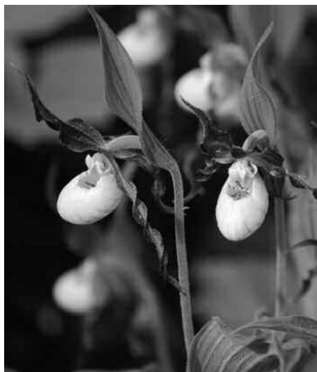
Yellow lady's-slipper ( Cypripedium parviflorum var. makasin )

Certificate: Core: FB/Adv.HD; Elective: all certificates