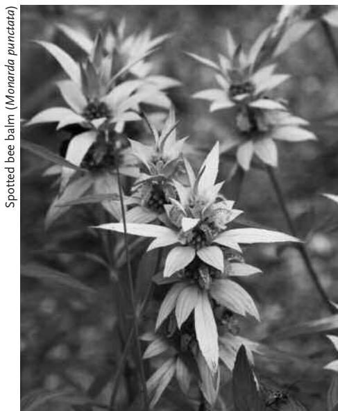
Spotted bee balm ( Monarda punctata )