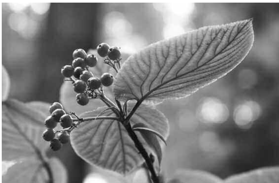
Hobblebush ( Viburnum lantanoides )